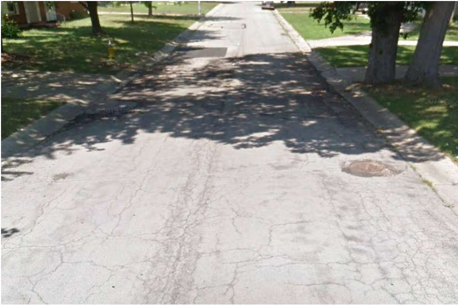
Elmore Street (North View)