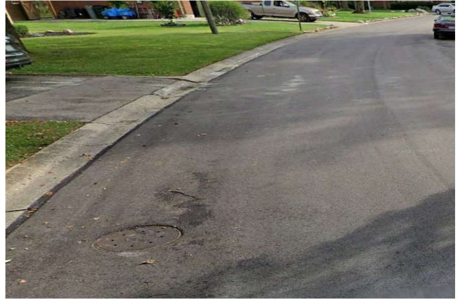
Hillpoint Street (South View)