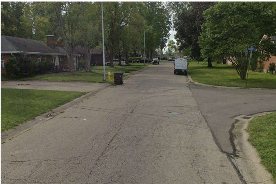
Sherry Drive (Northwest View)