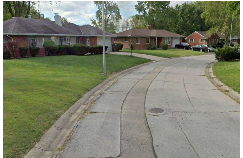
Sherry Drive (Northwest View)